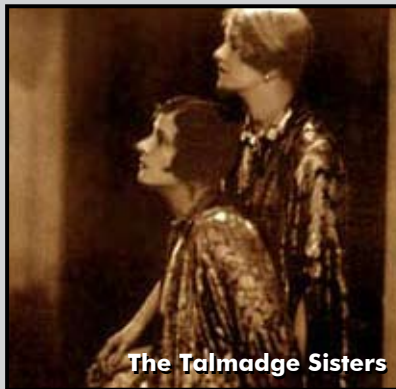
The Talmadge Sisters

The Constance Talmadge Collection brings us Her Night of Romance (1924) about an heiress who travels to England in disguise to discourage fortune-hunters and falls in love with a handsome nobleman, plus Her Sister From Paris (1925) with Constance in comedic dual roles as a frumpy-but-faithful housewife and her sophisticated twin sister. ( www.kino.com )